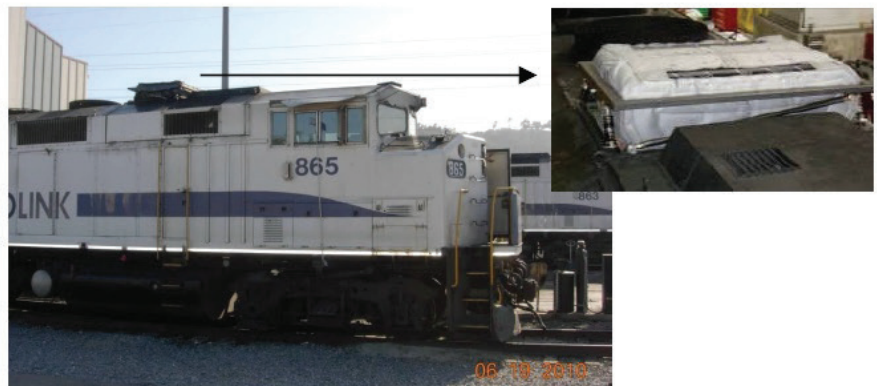
Photograph by Ian Stewart July 17 2014 Charlotte NC.

Recently, a new iteration of the CSCR system called the Blended Aftertreatment Systems (BATS) has been developed in California by the team at Rail Propulsion Systems (RPS). The BATS addresses the issues that were inherent to the CSCR and shows promise to provide near Tier 4 emissions reduction for existing passenger locomotives. Passenger locomotives typically have two engines, one main engine that provides propulsion and a second smaller HEP generator engine that