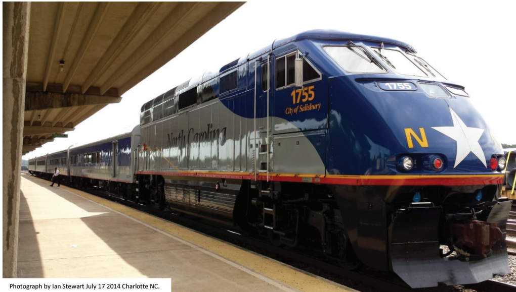
July 17 2014 Charlotte NC.